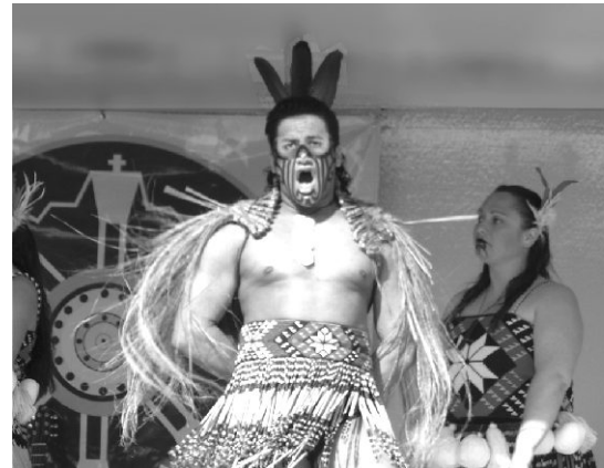
Kahurangi Maori Dance Theatre of New Zealand

In Inwood Hill Park, we find the only remaining old-growth forest and natural salt marsh in Manhattan. As long as 3,000 years ago, it served as a bountiful place for hunting and gathering. Here, Drums Along the Hudson connects the past and the present – the ancient traditions of New York's first inhabitants and the richness of contemporary Native American culture.