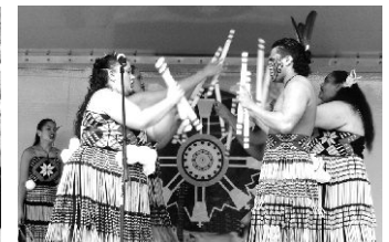
Maori Dance Theatre