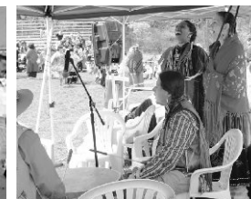
Pow Wow Drumming & Singing