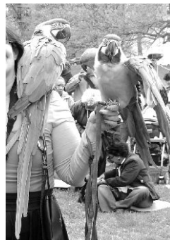
"Parrots for Peace"