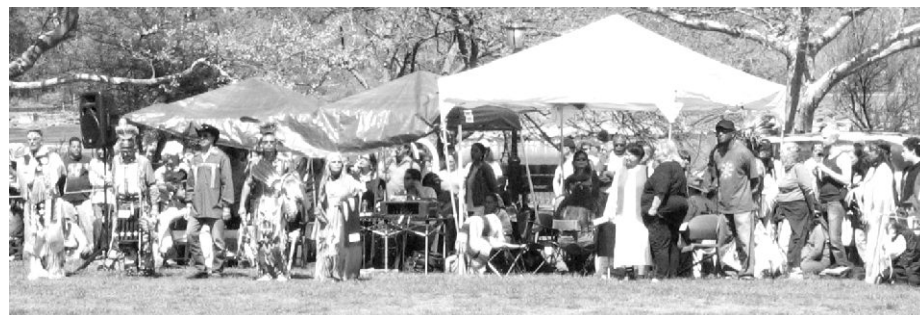
Participants gather for the Pow Wow

The Thunderbird American Indian Dancers Established in 1963, the Thunderbird American Indian Dancers are the longest running resident New York City Native American Dance Company. Their performances feature a diversity of dance forms that reflect the group's multicultural tribal membership. Their mission is to preserve and perpetuate American Indian cultures and promote a more realistic understanding of Native American cultures through their performances and other activities. The Thunderbird American Indian Dancers have performed around the world. All of the money raised by the Thunderbird Dancers goes to a scholarship fund for Native American youth. To date, they have assisted over 200 Indian youth with their educational expenses. The Thunderbird American Indian Dancers conduct pow wows across the country during the summer season, a monthly pow wow at the McBurney YMCA during the winter and perform an annual benefit at New York's Theater for the New City.