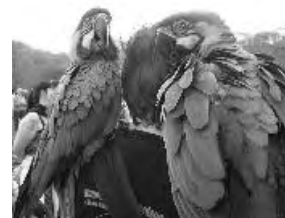
"Parrots for Peace" - 2007