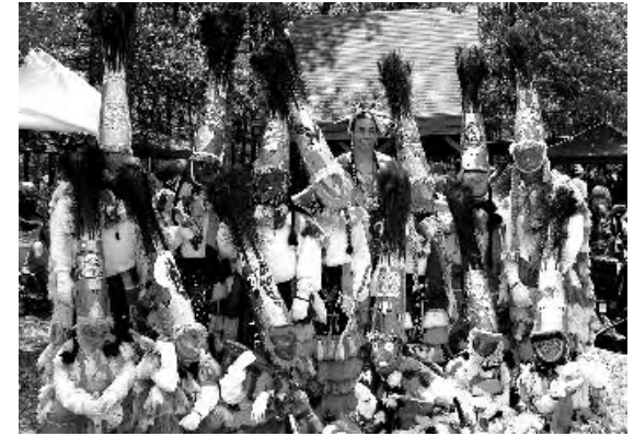
Warwick Gombey Troupe from Bermuda

In Inwood Hill Park, we find the only remaining old-growth forest and natural salt marsh in Manhattan. As long as 3,000 years ago, it served as a bountiful place for hunting and gathering. Here, Drums Along the Hudson connects the past and the present – the ancient traditions of New York's first inhabitants and the richness of contemporary Native American culture.