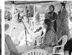
Pow Wow Drumming & Singing